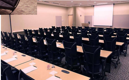
Red Jacket Meeting Room