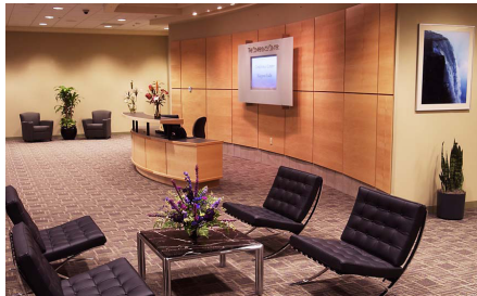
Business Center Lobby